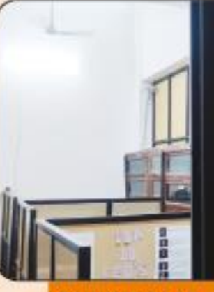
COMMERCE LAB AND ACCOUNTANCY LAB