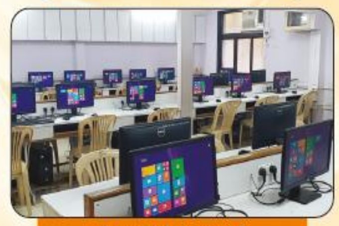
Computer Laboratory 2