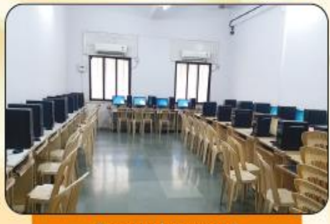
Computer Laboratory 1