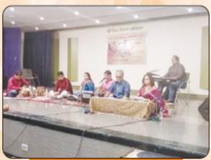
मराठी वाङ्मय मंडळ