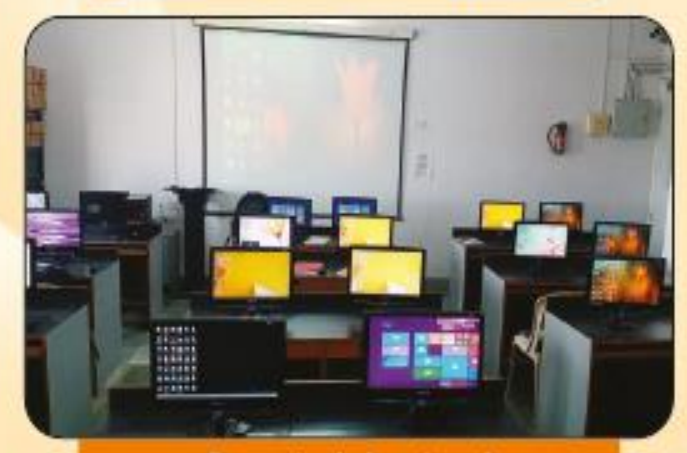
Computer Laboratory 4