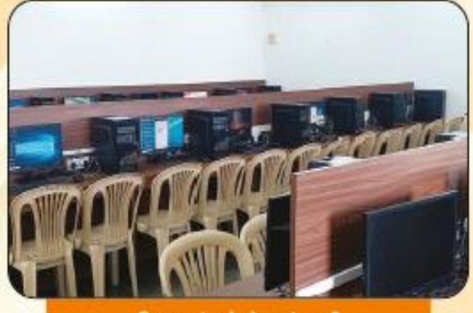
Computer Laboratory 3