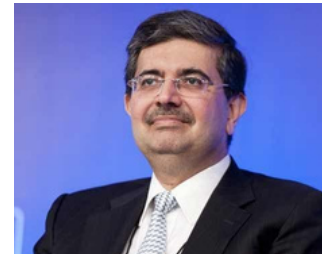
The Banker Who Became PresidentHint: I led Kotak Mahindra Bank from NBFC to a top-tier private bank.