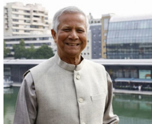
Founder of HDFC BankHint: Known as the 'Father of Microfinance', I won the Nobel Peace Prize in 2006."